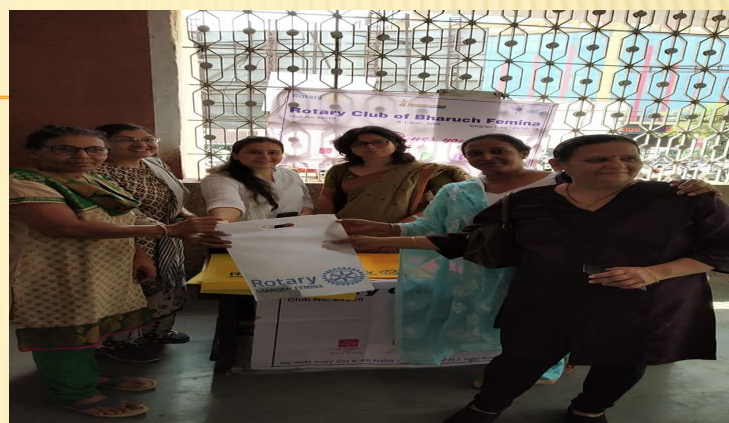
DISTRIBUTION OF CLOTH BAGS TO MOTIVATE PEOPLE TO SAY NO TO PLASTIC