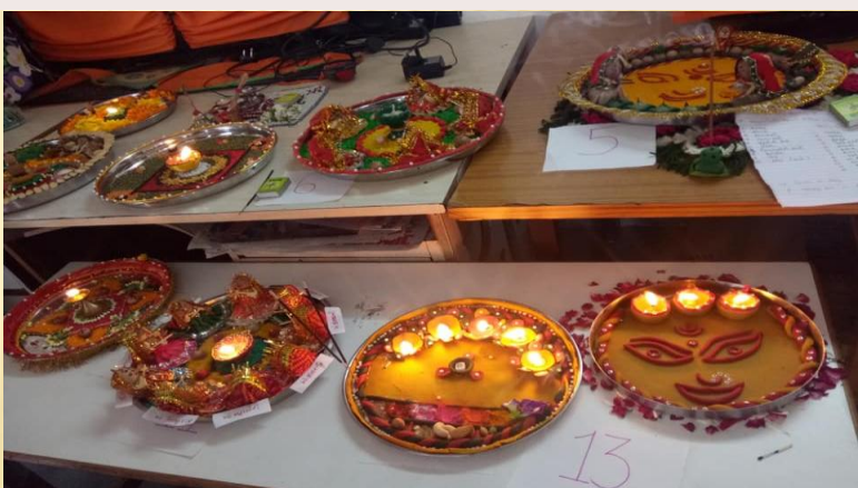
AARTI THALI DECORATION COMPETITION