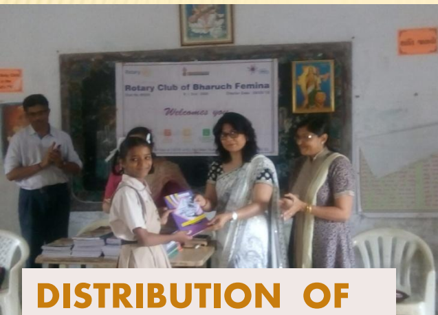
DISTRIBUTION OF DICTIONARIES AT PIONEER SCHOOL