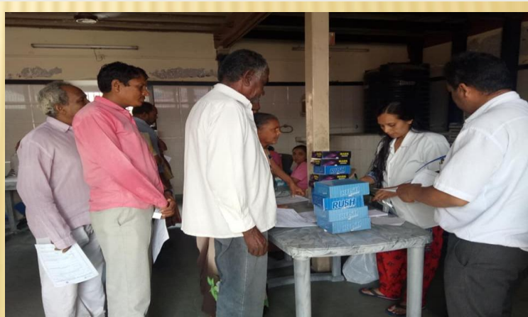
EYE CHECK UP CAMP FOR VILLAGERS