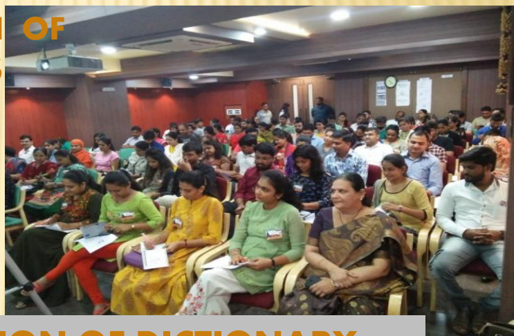
DISTRIBUTION OF DICTIONARY