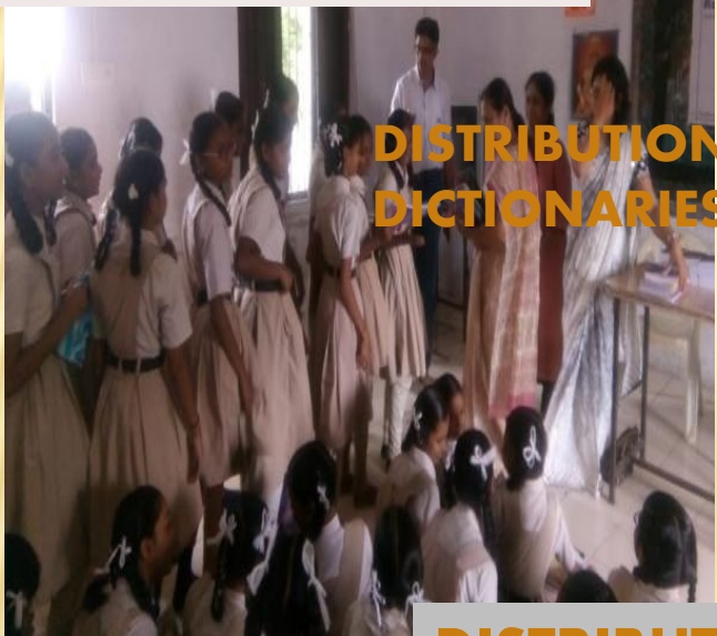
DISTRIBUTION OF DICTIONARIES